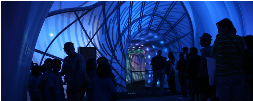
Adler Planetarium: Futuristic space terminal

In spite of their differences, the libraries of the RAILS consortium are united together by a common desire to share their resources.