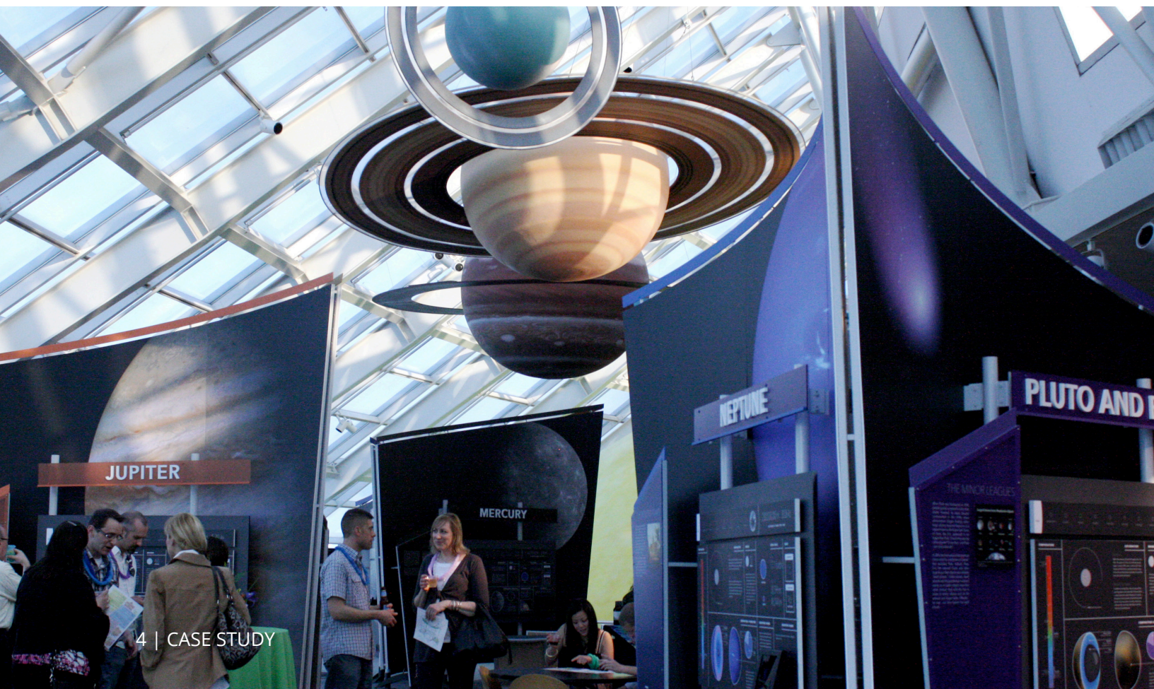
The Solar System Gallery, in the Sky Pavilion of the Adler Planetarium.

Reaching the active user population, Orrison noted, is also of equal importance. "Often library users aren't going directly to catalog when they're searching for something they're going someplace else. They're probably out googling the newest James Patterson novel looking for an overview of it to see if they want to have it. They would see in the results that their library is in the results and they can know that they can just go check it out."