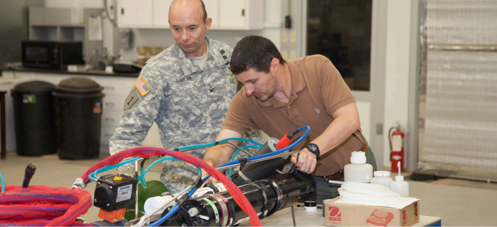
ERDC CHL's Soils Lab

reports and articles are visible in search engines like Google, Yahoo and Bing is an important part of completing the publishing process. Search engines are where many researchers are beginning their research and finding experts on important topics... [BLUEcloud Visibility] can translate into more relevant search results for users and more users viewing and citing ERDC authored reports, journal articles and other publications."