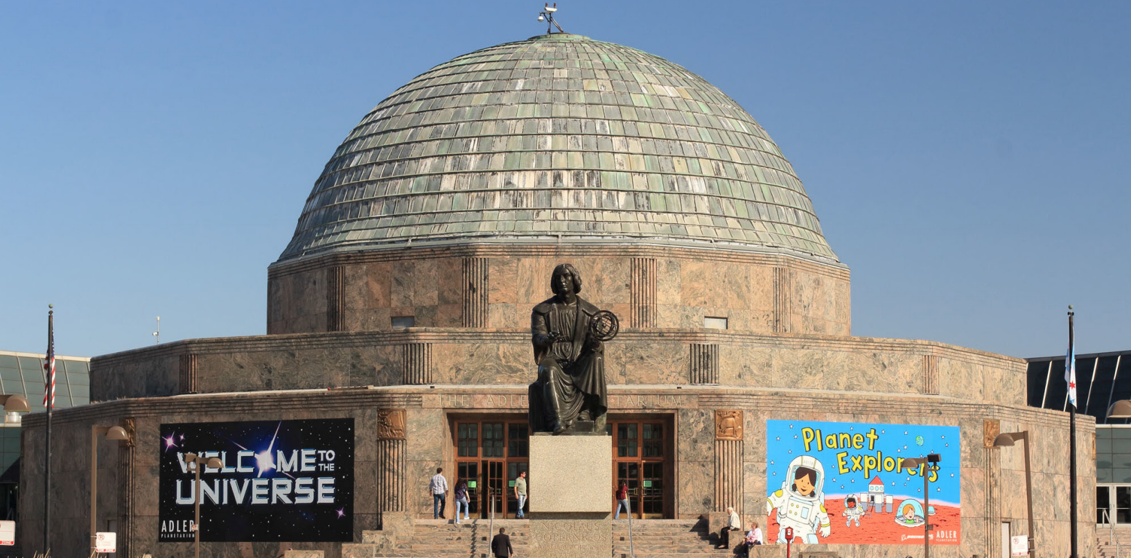
Top photo: Adler Planetarium.